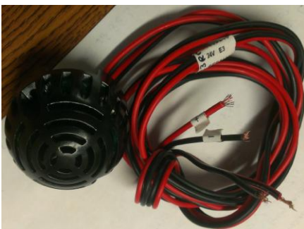
Temperature sensor assembly

Measure the resistance of one set of wires (each set are fused together at the jacketing, one red, one black). Refer to the maintenance manual temperature charts located in the climate control section. Review the chart of temperatures and corresponding resistances i.e. 4700 ohms at 77 degrees Fahrenheit. The set of wires associated with the fan will have a resistance of approximately 170K ohms.